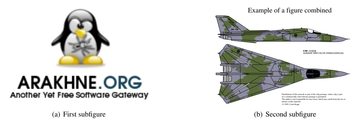
Figure 5.2: Example of subfigures with mfigures

The reference and page reference are obtained with \figref{example:msubfigure} and \figpageref{example:msubfigure}.